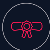
Grants and Education