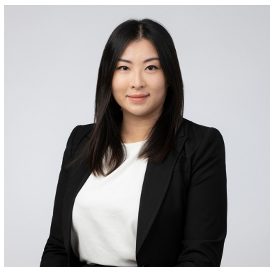
Maria On 區