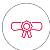
Grants and Education